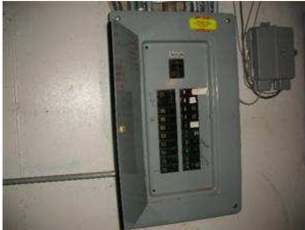
5.1 Picture 1