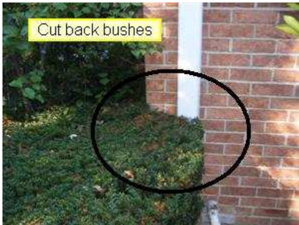
2.11 Picture 1

There was some vegetation growing against the house ( Picture 1 ) and roof ( Picture 2 ) that should be cut back.