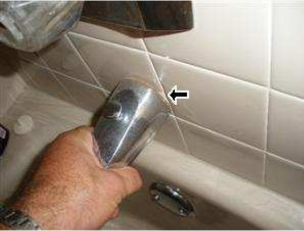
4.2 Picture 1