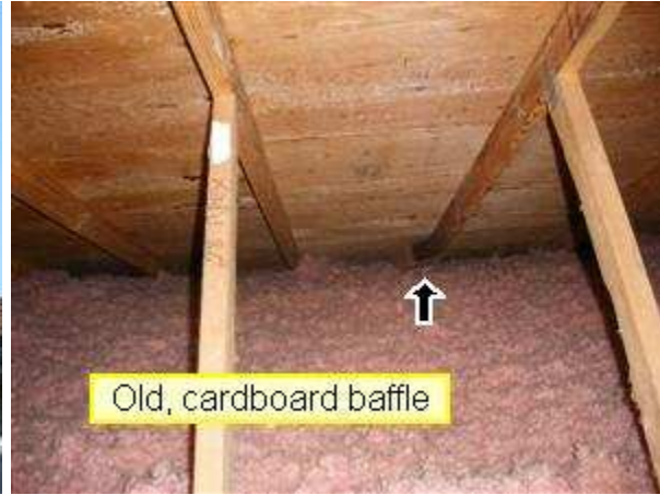
9.4 Picture 2