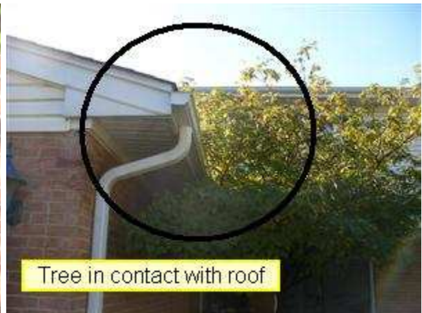
2.11 Picture 2