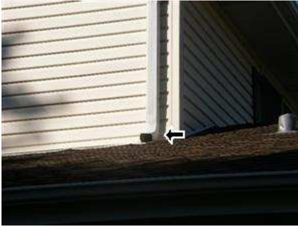
3.2 Picture 1

The downspouts displayed no signs of rust or physical damage and were properly secured to the house. There were some areas where the downspouts drained too close to the foundation of the house ( Picture 2 ).