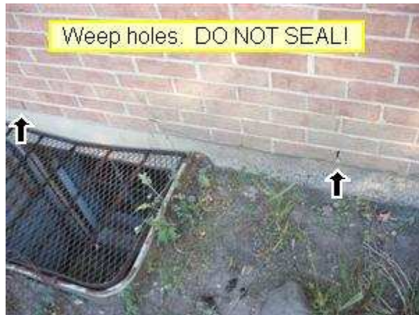
2.0 Picture 3