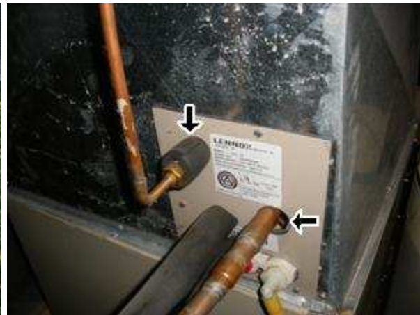
7.0 Picture 2