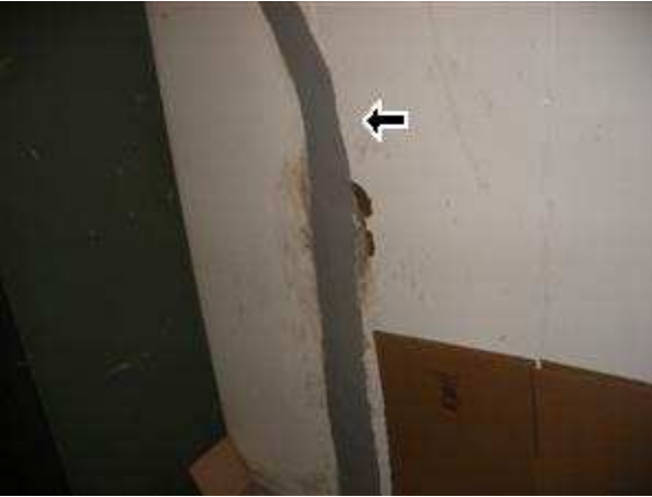
1.0 Picture 1