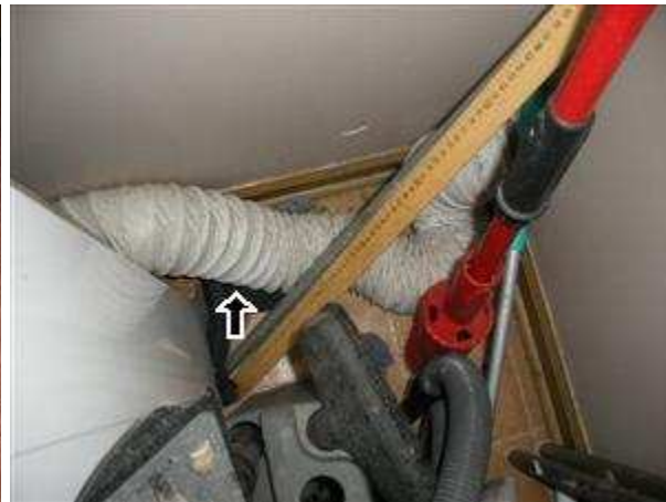
9.2 Picture 2