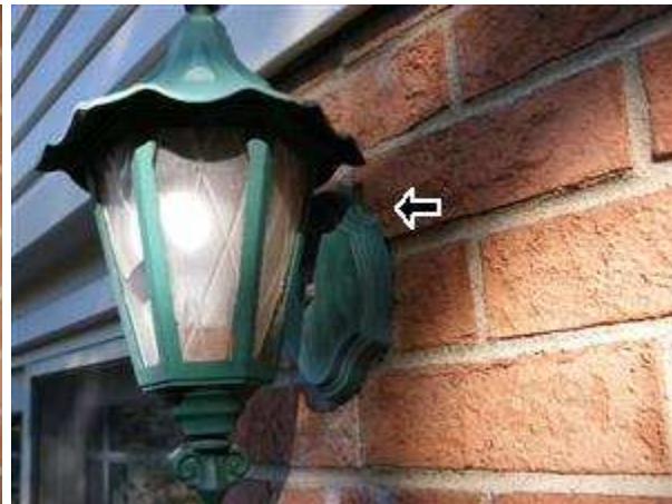
5.4 Picture 2