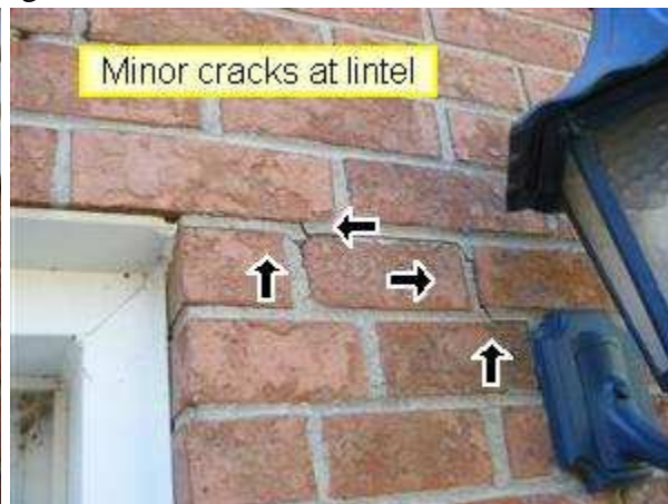
2.0 Picture 2