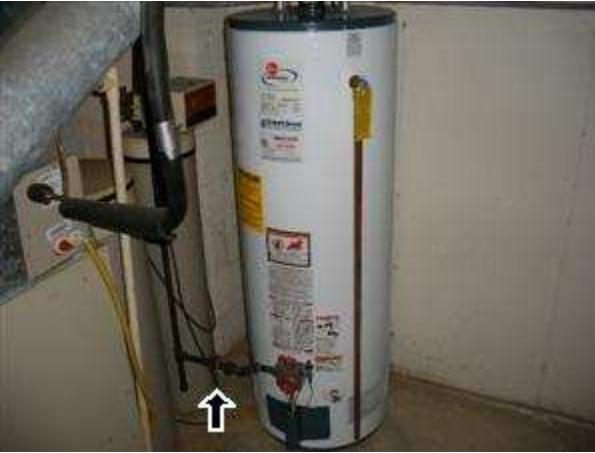
4.4 Picture 1