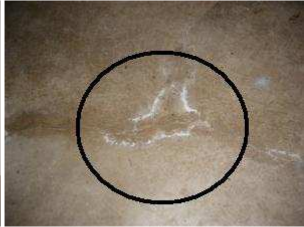
1.0 Picture 2