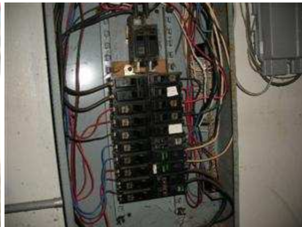
5.2 Picture 2