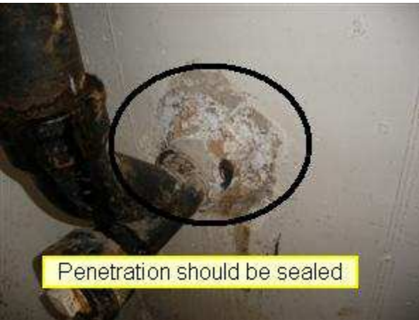
1.0 Picture 3