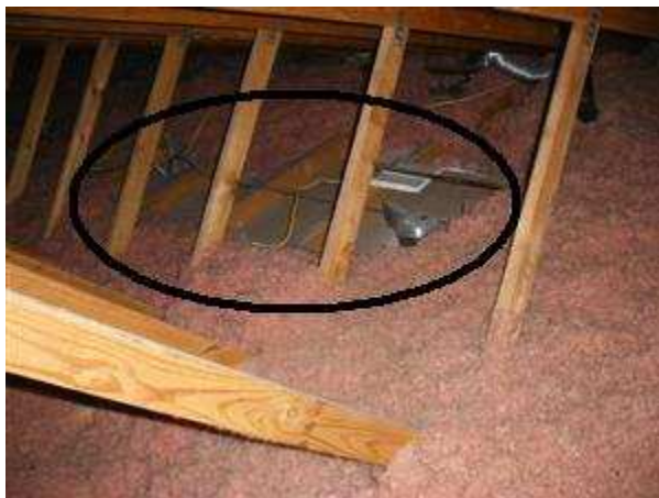
9.0 Picture 1

There were areas where the existing insullation was removed ( Picture 1 ) and should be replaced.