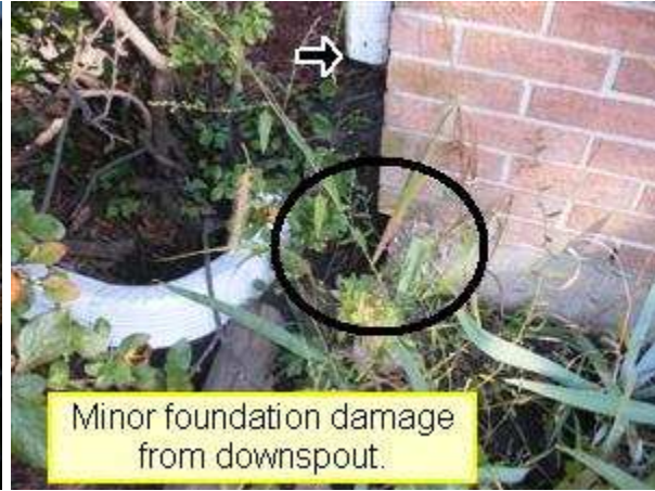
3.2 Picture 2