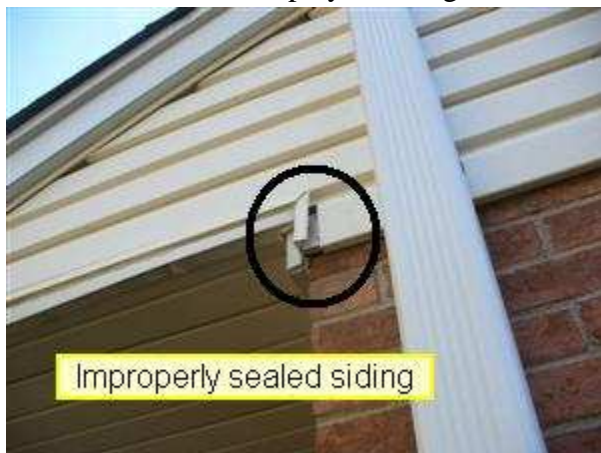
2.0 Picture 1

The exterior walls of the house were covered with vinyl siding, with the lower level covered with brick veneer with stone trim. The vinyl siding displayed no signs of physical damage and was properly secured to the house. The siding ends were properly equipped with J bar terminations. There was some small areas that displayed openings where the siding was not properly sealed ( Picture 1 ). The brick veneer displayed some minor signs of cracking at the garage lintel ( Picture 2 ) and was properly equipped with weep holes where it met the foundation wall ( Picture 3 ). The limestone trim displayed no signs of cracking.