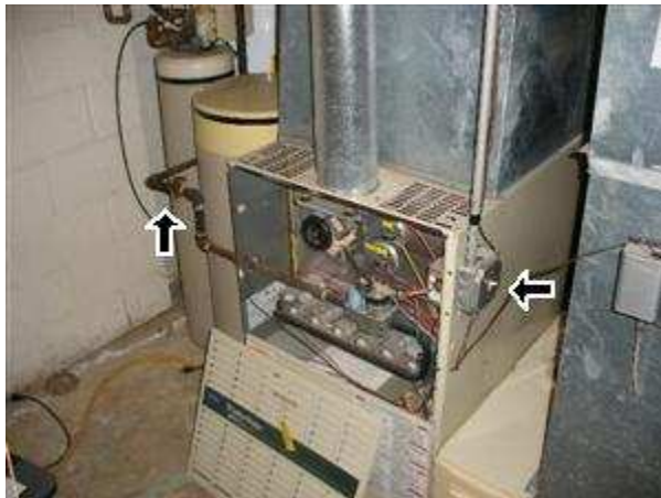
6.0 Picture 1

The unit was operated and displayed the proper color flame. It delivered heat with, at least, a 15 degree differential measured at the supply registers. Carbon monoxide readings were within normal limits.