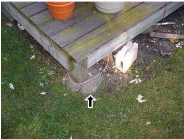
2.8 Picture 1

The rear of the house was equipped with a wooden deck which was properly footed ( Picture 1 ) and displayed no signs of rot or unevenness. It was not equipped with railings or handrails, which are not required because the deck is not above 36". Given that there will be a small child in the house, it is recommended that railings be installed on the deck. The front porch was a concrete slab. It displayed no signs of cracking or displacement.