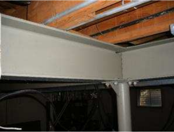
1.3 Picture 1