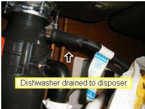
10.0 Picture 1