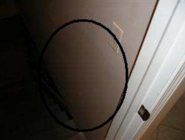
8.5 Picture 1

Upper level and basement stairs were even, tight and secure. The stairway to the basement was not properly equipped with handrails ( Picture 1 ).