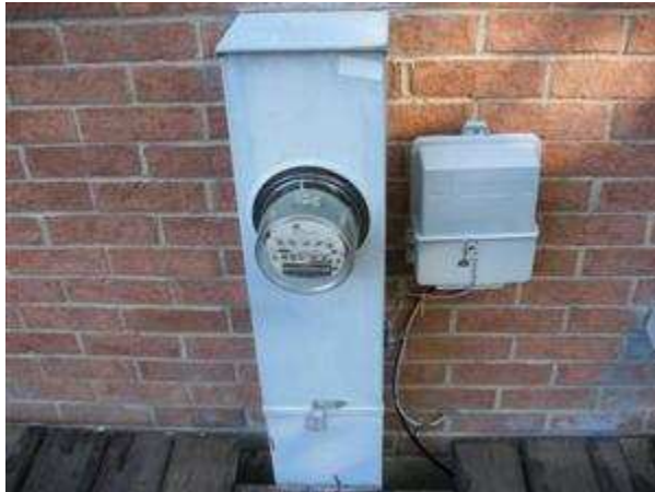
5.0 Picture 1

Electrical service is supplied by means of an underground (lateral) service drop from the utility pole to the meter box located at the rear of the house (Picture 1). The meter was rated for 200 amp service.