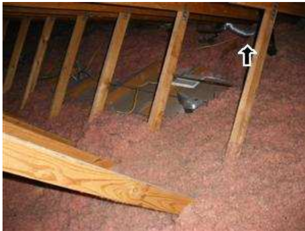
9.2 Picture 1

It should be noted that the clothes dryer vent (Picture 2) was vented by means of a vinyl vent hose. There have been many reports of fires caused by the use of vinyl vent hoses due to their flammable characteristics.