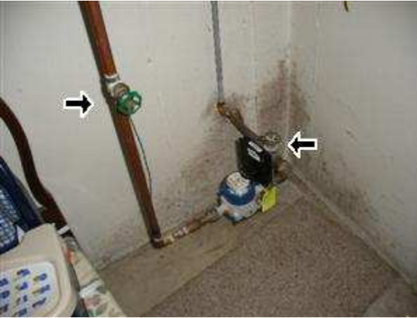
4.6 Picture 1