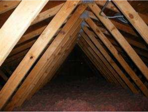
1.6 Picture 1