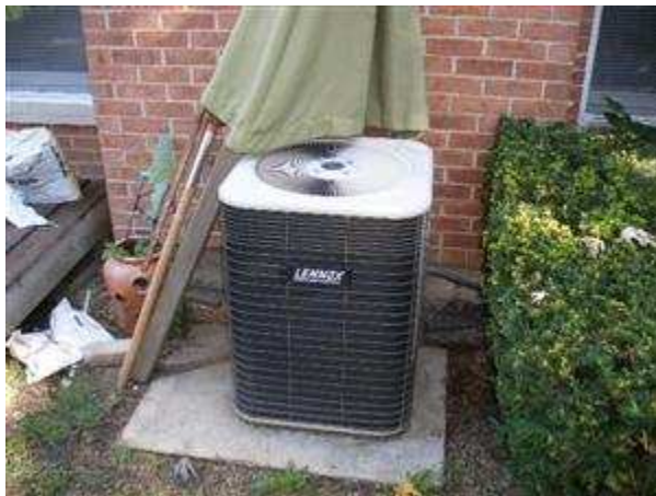
7.0 Picture 1

The lines to the plenum coil were not properly sealed to the plenum above the furnace ( Picture 2 ). When operated, the A/C system displayed signs of refrigerant loss.