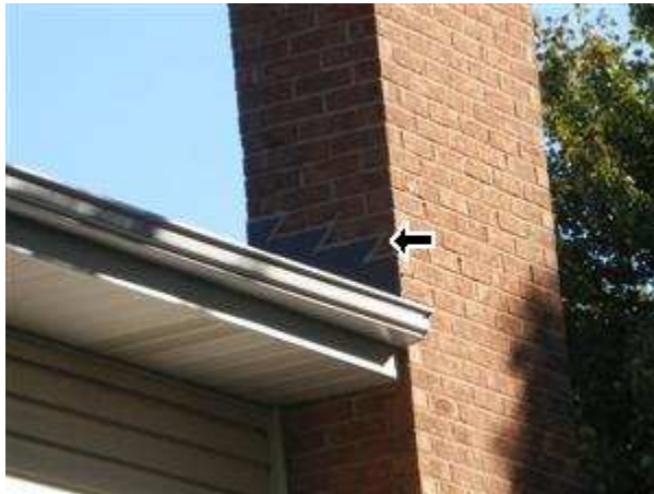
3.1 Picture 1

All roof penetrations were inspected and displayed proper flashing. The chimney was equipped with step and counter flashing ( Picture 1 ) which was intact.