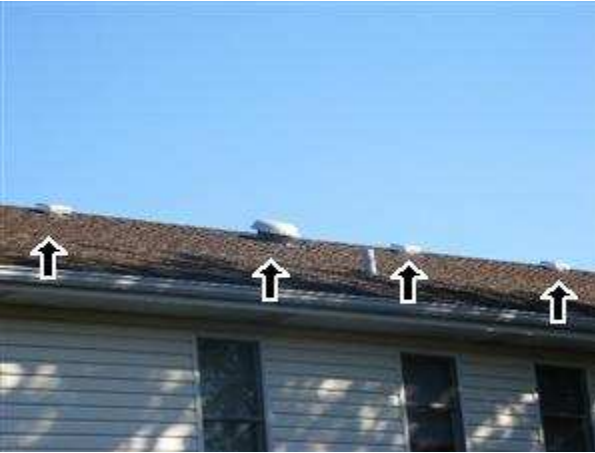
9.4 Picture 1