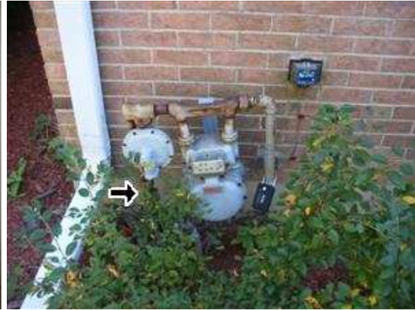
4.6 Picture 2