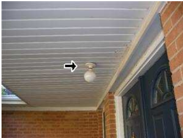
5.4 Picture 1